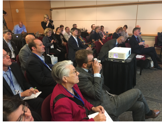
FIGURE 4 ATTENDANCE TO THE GEO WEEK 2017 SIDE EVENT