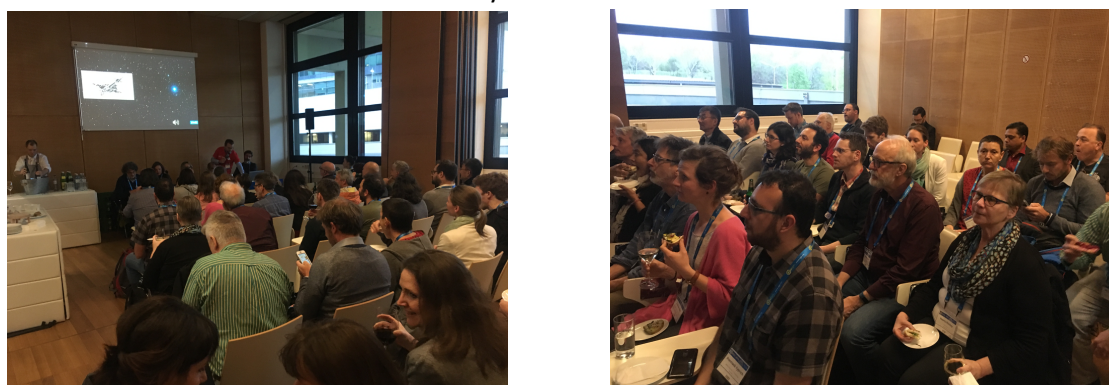
FIGURE 6 THE AUDIENCE DURING THE TOWNHALL MEETING

One of the main outcomes was to at least follow up on this session in the next AGU conference (December 2019) and EGU2020. The ENVRIFAIR project should be able to pick up the hosting of another one of these Town Halls next year in EGU.